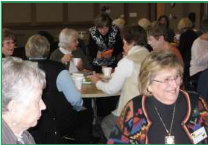
All members enjoyed the time to visit during the soup lunch.