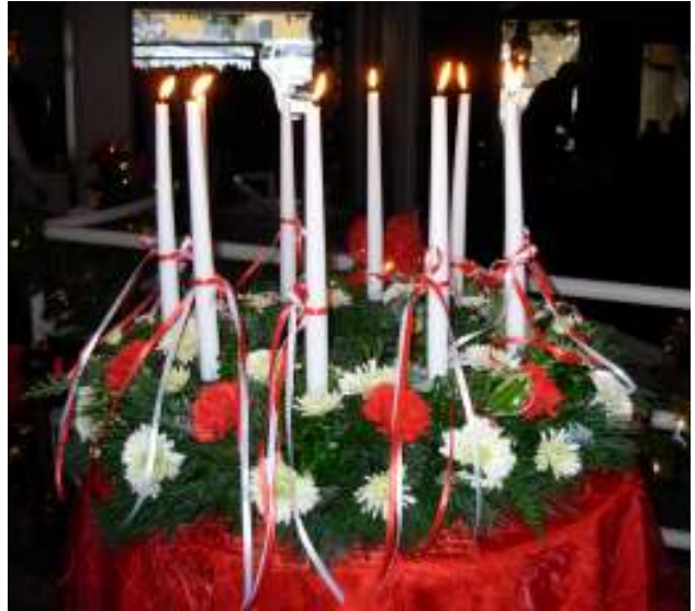
All officers placed their lit candle into this beautiful wreath