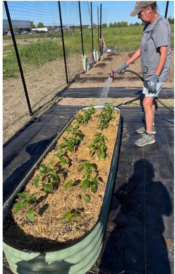
Working in the Community Vegetable Garden