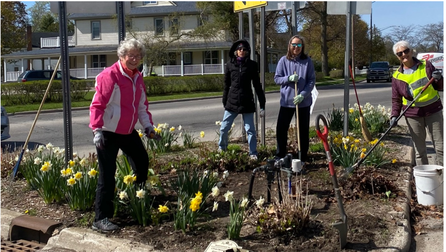
The Triangle Garden Crew