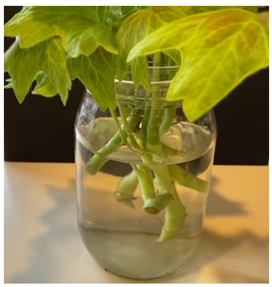
once the cuttings are in water, roots begin to form

For more information and to see Rhea's technique for bringing a touch of spring indoors during February, check out our latest blog post: https://www.charlevoixareagardenclub.org/post/bringing-a-bit-of-spring-indoors-in-february