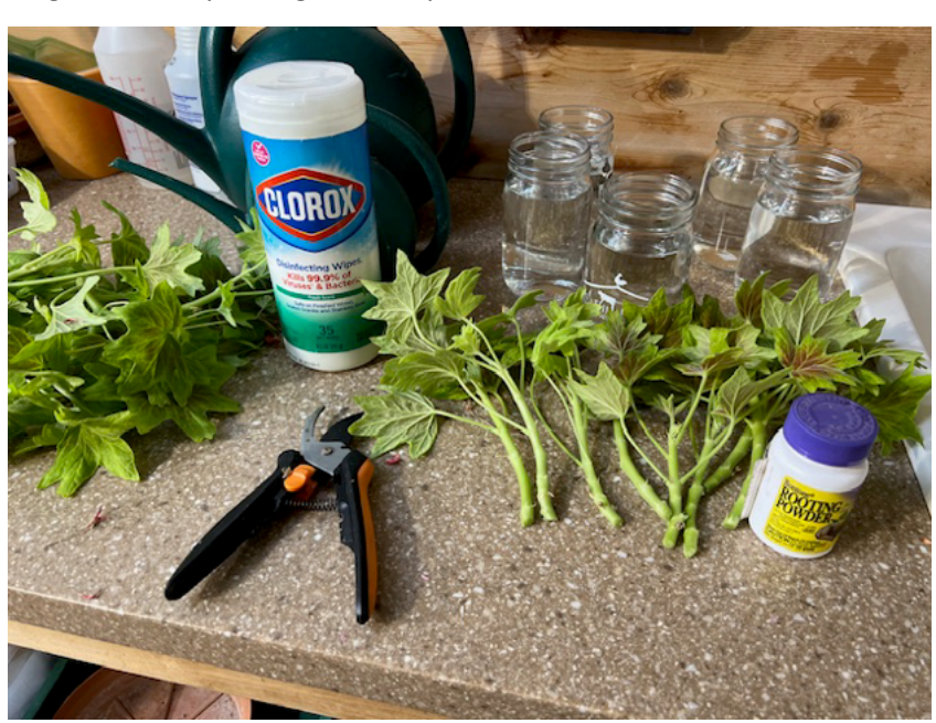
the cuttings and the equipment