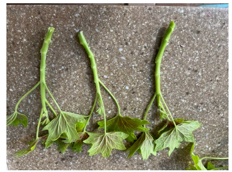
the cuttings are ready for water