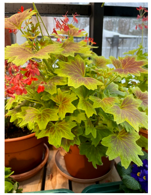
cuttings are taken from the "mother plant"

The following photos demonstrate Rhea using cuttings to develop new geranium plants: